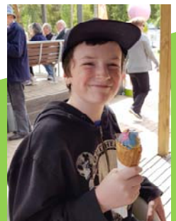
No trip to Halls Gap is complete without Ice-Cream!!!