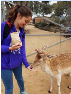
Nyah's had food, so she was popular